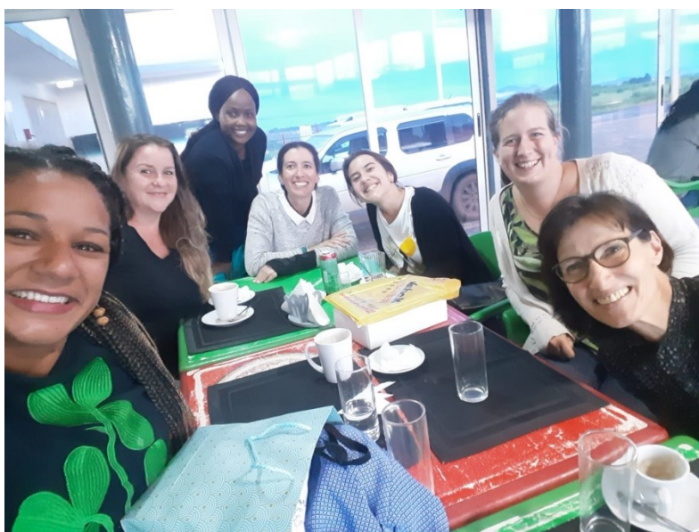
Friends from 5 nations, including Mozambique!